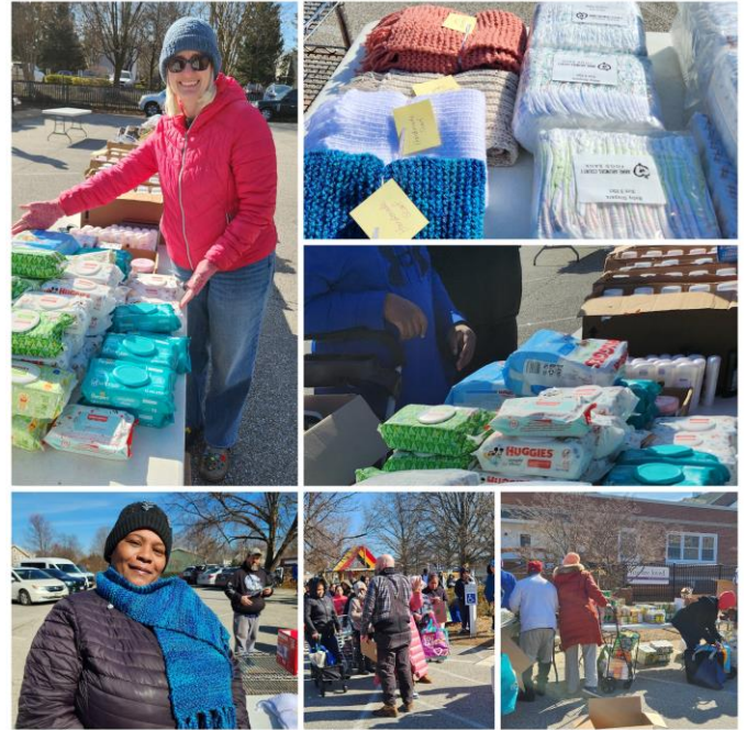
A Cold Day at our February Pantry

The focus for our March pantry is dish soap ...Palmolive, Dawn, store brands, any brands are welcome. Stop by the church office or bring them to church on Sunday. Pantry date is March 15 th . And as always, thank you!