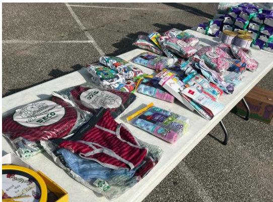
THANK YOU FOR YOUR DONATIONS OF CHILDREN'S UNDERWEAR