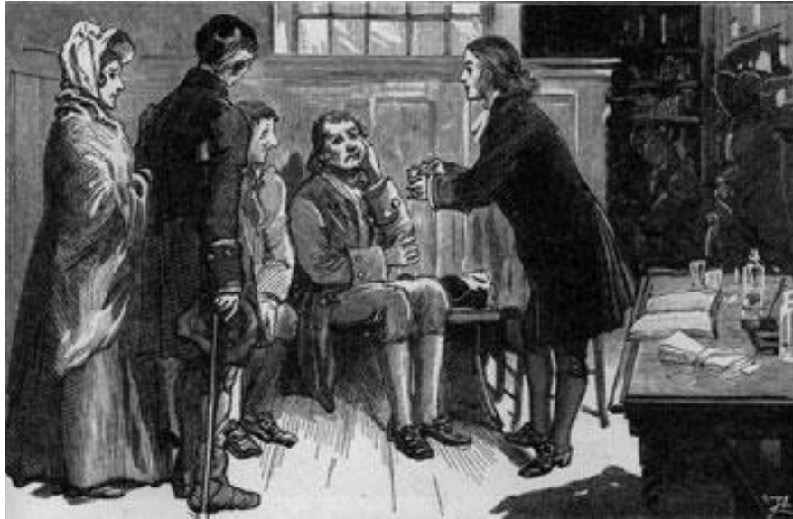
John Wesley ministering to the sick.