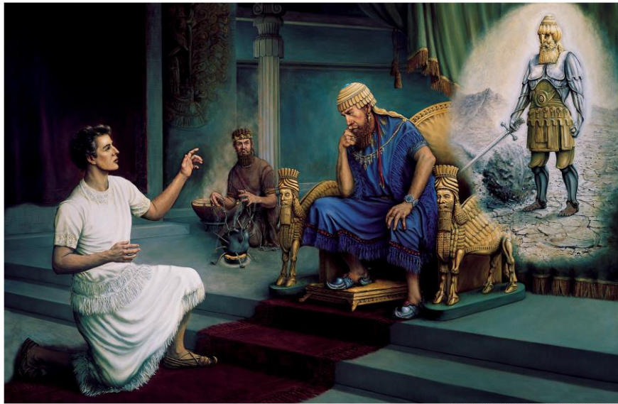
Daniel interpreting the king's dream.